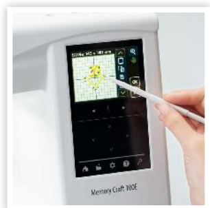
3.5" LCD COLOR TOUCH SCREEN