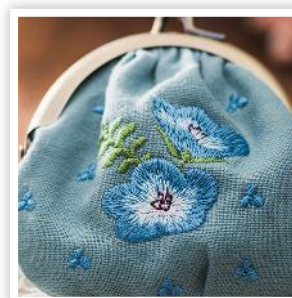
274 BUILT-IN EMBROIDERY DESIGNS