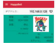
HAPPY BELL Mobile Device Application for machine status notification