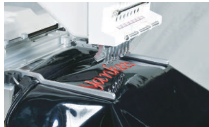
Side Clamp Frame (140×220mm)