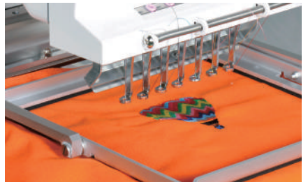
Manual Clamp Frame (Large:150×300mm Small:150×150mm)