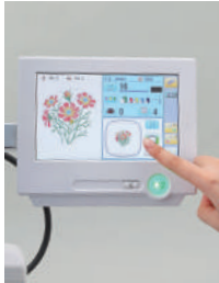
Touch Panel 999 patterns memory 40,000,000 stitches memory