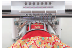
One Point Frames