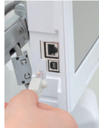
LAN and USB connection