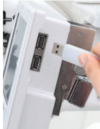
USB and Mouse