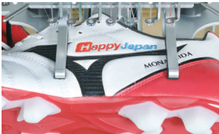
Shoe Clamp Frame (60×100mm)