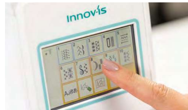
Colour LCD touchscreen