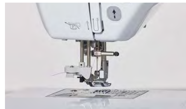
Advanced needle threader