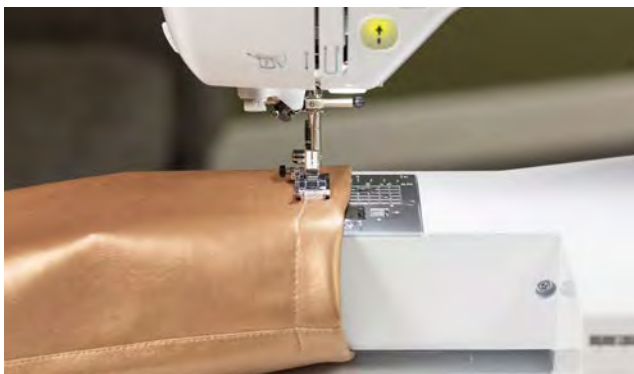
Free arm sewing