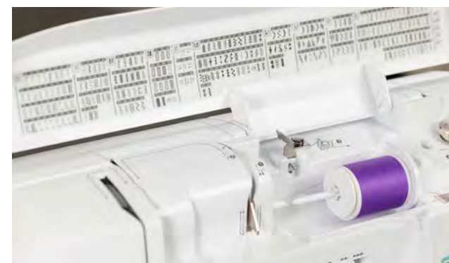
241 built-in sewing and decorative stitches