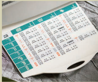
Need advice? Reach for your Sewing Guide Reference Chart! Your EMERALD™ features a simplified Sewing Guide Reference Chart that helps with the right settings. Pull it out from the base of the machine.

EMERALD™ 118 creates 70 stitch functions.