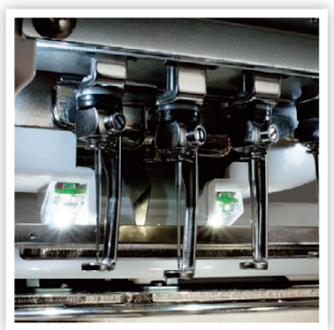
6 WHITE LED LIGHTS