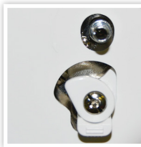
INDEPENDENT BOBBIN WINDING MOTOR