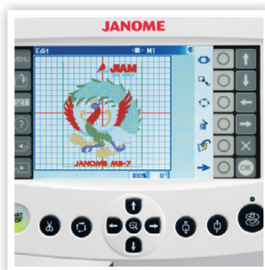
RCS (REMOTE COMPUTER SCREEN)